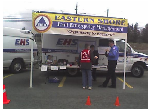
ES-JEM & First Responders at the JEM Jamboree, Porters Lake Superstore Emergency Preparedness Week 2007