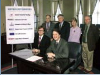
Metro University Presidents Consortium