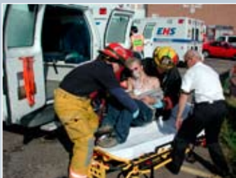
Mock Emergency Exercise