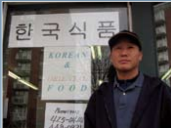
Intergovernmental working relationship regarding new entrepreneur immigration program