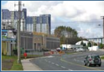
Halifax Wastewater Treatment Facility, Upper Water Street