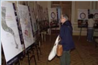
Central Library open house presentation, June 2008