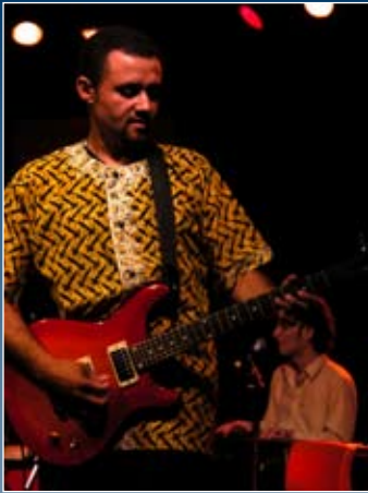
A vibrant and unique community - Multi-Cultural Festival