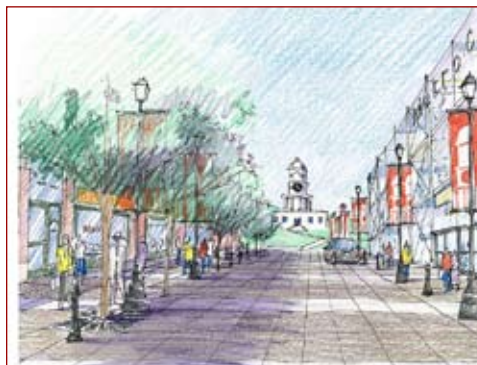
Grand Promenade looking west towards the Clock Tower

One of the 10 “Big Moves” of the Downtown Halifax Vision - #6. Great streets that support a culture of walking