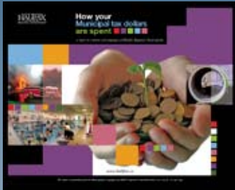
"How Your Municipal Tax Dollars Are Spent", 2008