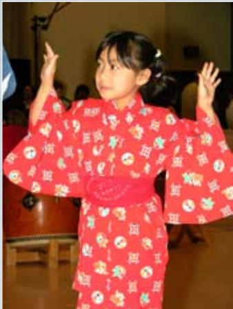
Hakodate twin-city anniversary celebrations