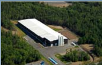
BioSolids Processing Facility, Aerotech Park, 2007