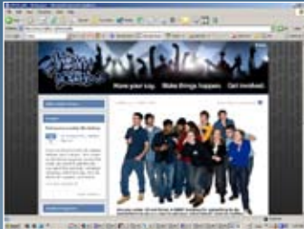
Youth engagement - www.hrmyouth.ca