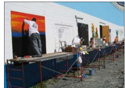
Reducing graffiti - community artists paint murals along the Harbour Front Trail, Downtown Dartmouth