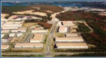
Burnside transportation infrastructure completed, 2007/08