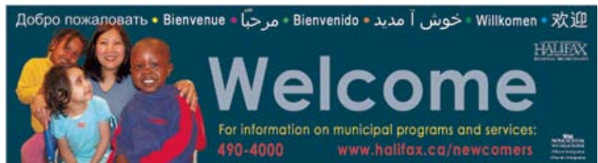
Metro Transit Bus Ad