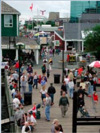
Halifax Waterfront Boardwalk