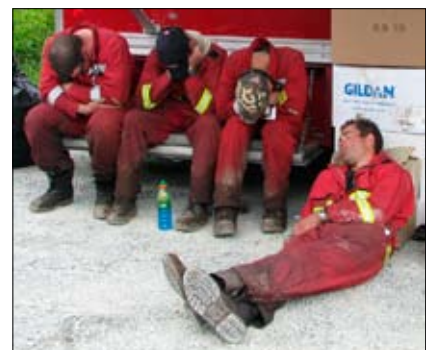
Lake Echo/Porter's Lake Fire, June 2008