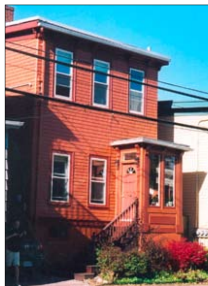
Registered heritage property, North Street, Halifax