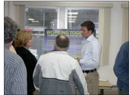
Tax Reform public consultation meeting, 2008