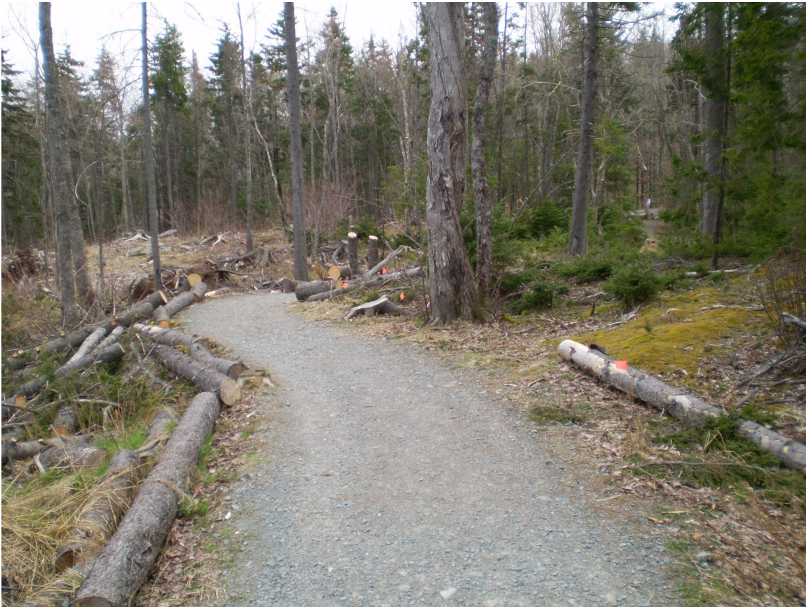
Flags along the Rockingham Loop

It was evident that some of the waste was left during the winter but most had occurred recently. Six flags were used on the School Trail. Two flags were used in the Governors Loop off leash area. The remaining deposits of dog waste were located along the Rockingham Loop.