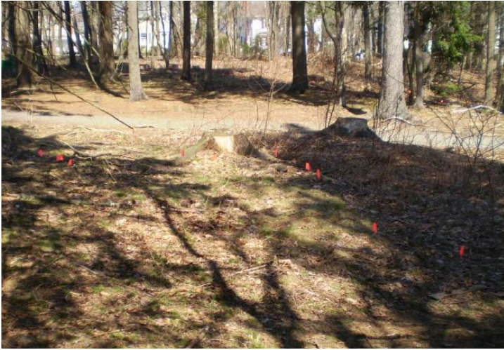
Flags near Lodge Road

Responsible pet owners have voluntarily cleaned up some of the waste but there is much more to be removed. Park staff will conduct a thorough cleanup of the site on Friday, April 25.