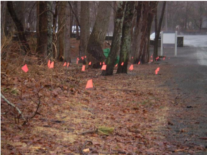
Flags on Cambridge Drive