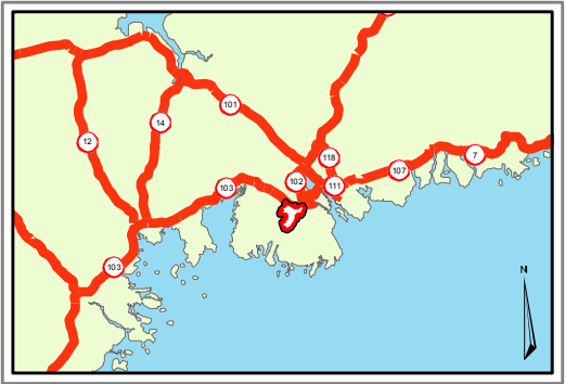
Figure 24 Forest Inventory Current Conditions

Projection: 3°MTM, Zone 5 Horizontal Datum: ATS77 March 2009