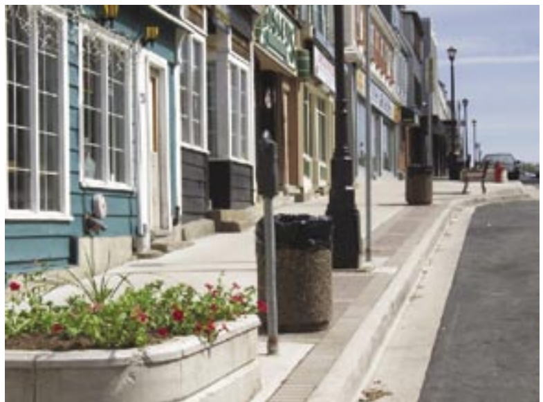
Portland Street reconstruction

The Capital District program is guided by the efforts of many people including staff who work across HRM, Halifax Regional Council, external organizations, and many public and stakeholder groups who work with us on an ongoing basis. A dedicated Task Force of 29 members representing municipal staff, the five area business associations within the Capital District and the Provincial Waterfront Development Corporation meet on a monthly basis to troubleshoot and improve service to the downtown areas. A Capital Commission board of directors representing the Mayor, CAO, senior staff and six councillors from the Capital District and suburban and rural communities within HRM, help shape strategic directions. Our core staff team includes five staff who work to deliver coordinated programs.