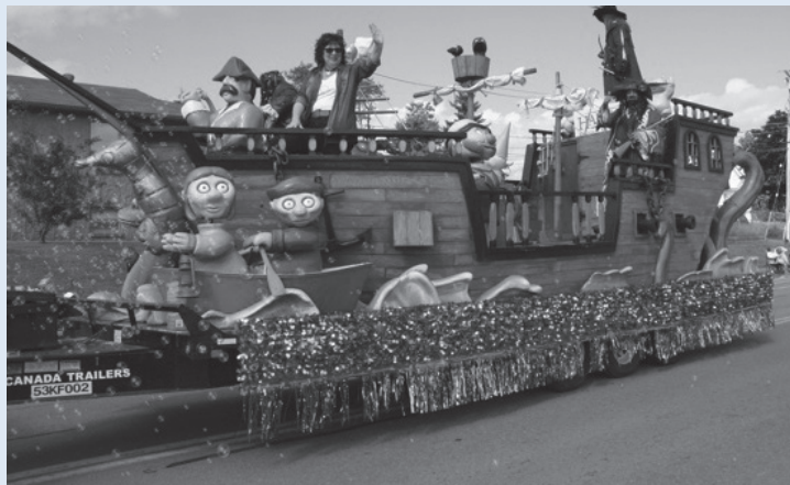
Councillor Jackie Barkhouse waves to the crowd from the HRM float at the Eastern Passage - Cow Bay Summer Carnival Parade.