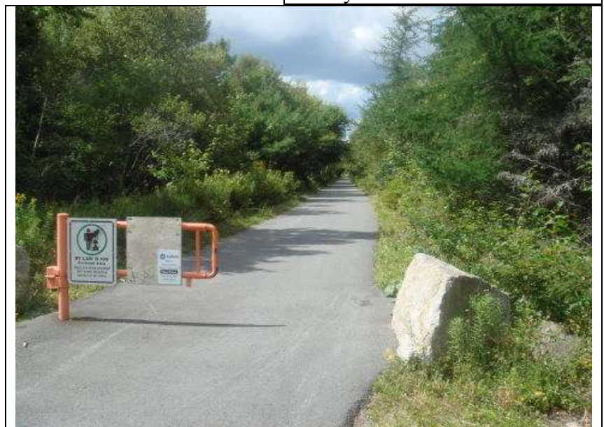
Example of a Paved Trail... (Part of the BLT Trail)