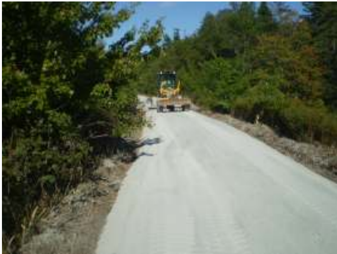
(Grading the Trail)