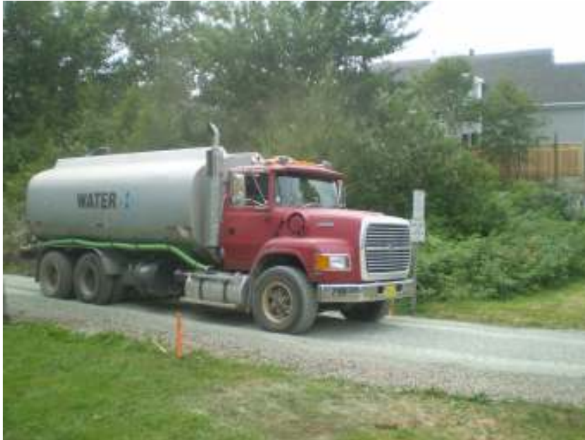
(Near Springvale Ave.)

-Emergency number is 911 (This is to be used when a caller believes that there is a situation which requires immediate Emergency response) See Below for More Info