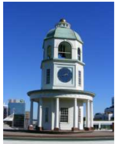
Our Town Clock