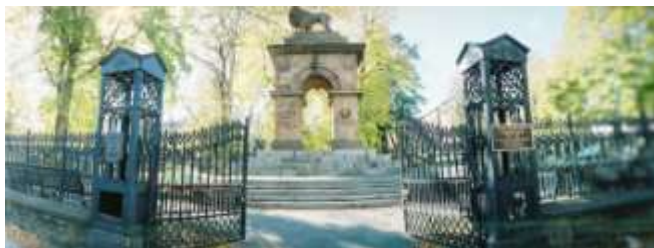
The Old Burial Grounds on Barrington Street