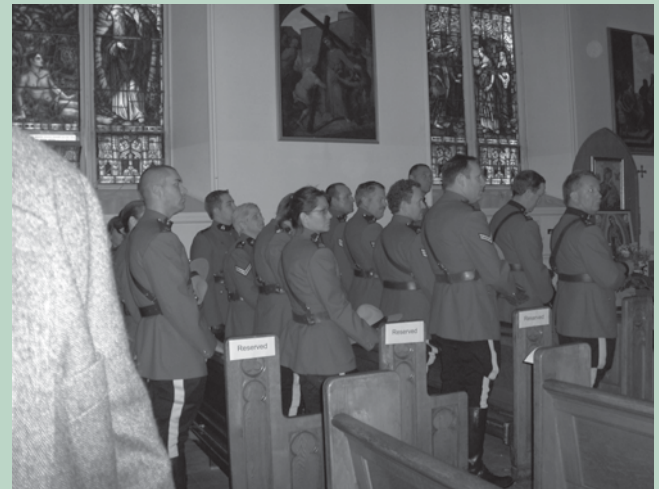
Police memorial Service at Saint Mary's Basilica, in memory of those who died in service.