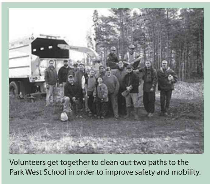
Volunteers get together to clean out two paths to the Park West School in order to improve safety and mobility.