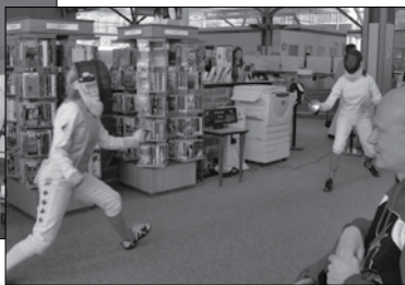
Fencing Demo for Canada Games