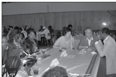
Uganda Celebration of Independence Day