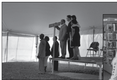
Naming of Africville Road

The Northcliffe Community Centre was a wonderful facility in its time but will be closing at the end of March 2011 when the new Canada Games Centre is fully opened to the public. Unfortunately, the hot tubs had to be removed from the facility; but, the good news is that the new Canada Games Centre will have a wonderful new hydrotherapy pool which can accommodate several users.