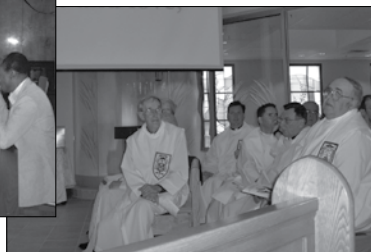
Opening of St. Benedict's Church