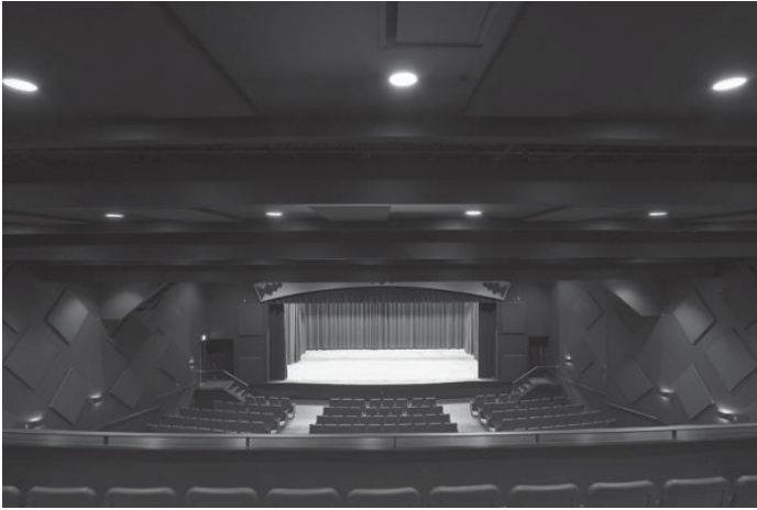
Bella Rosa Arts Centre (photo taken from balcony)

Come see our new 600 seat community theatre located in Halifax West High School.