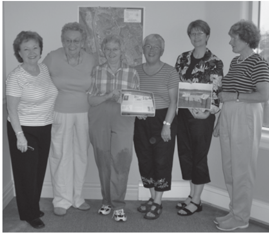
Belcher's Marsh Committee