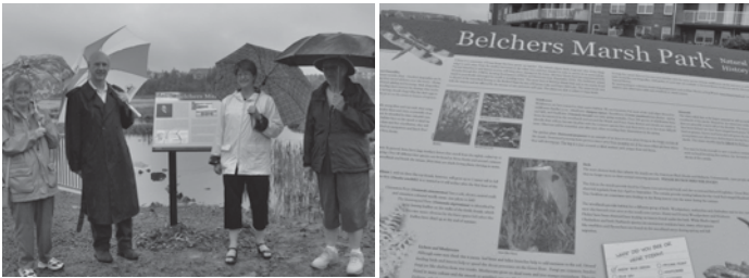
Belcher's Marsh signage