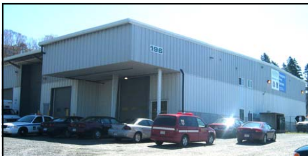
New Mechanical facility located at 196 Waverley Road, Dartmouth

The staff of the Mechanical Division would like to take this opportunity to thank everyone who attended the official opening.