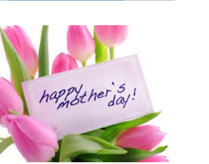
Sunday, May 13<sup>th</sup> is Mother's Day