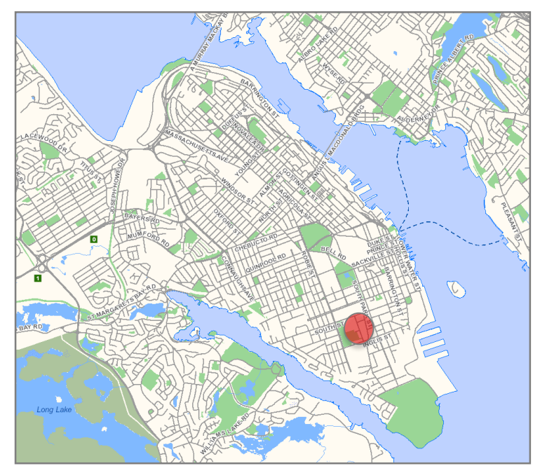
Site Boundaries in Red