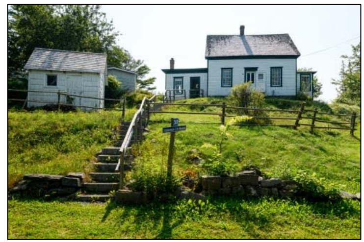
Figure 9: Photo of the Fisherman's Life Museum (https://fishermanslife.novascotia.ca/about-fishermans-life-museum)

The area is characterized by small single detached dwellings on larger lots grouped along Highway 7 and the waterfront. The property fits in well with this established building pattern and reflects the history of the area. The house located at 10175 Highway 7 was built and owned by the Myers family, a prominent family in the history of the Jeddore area. This community was settled by working class families and the form and style of the house was very common. The area currently features