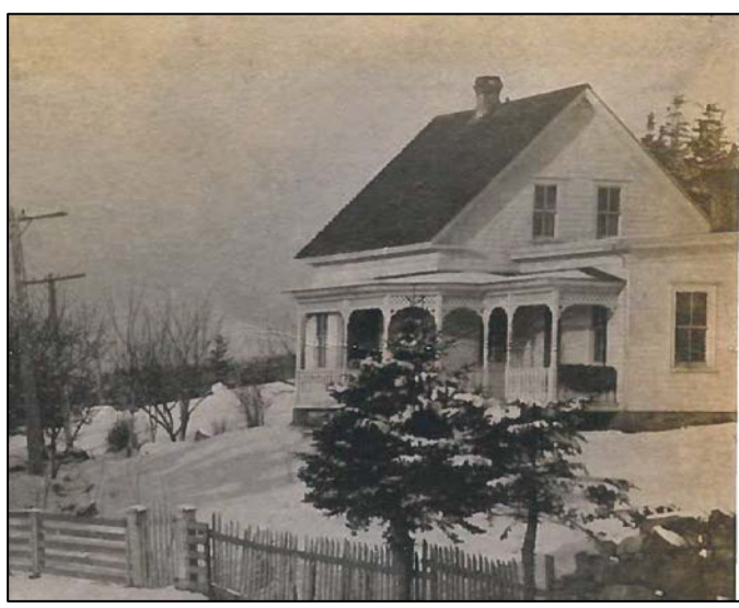
Figure 1: Photo of 10175 Highway 7 in the 1920s

A summer kitchen was constructed as a one storey addition to the house sometime before 1909. This type of