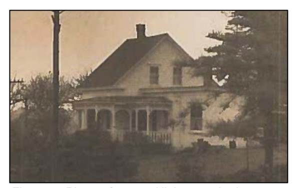
Figure 6: Photo of 10175 Highway 7 in the 1920s