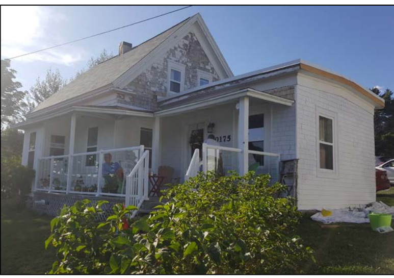
Figure 4: Photo of 10175 Highway 7 in 2019

The Myers House is a one-anda-half storey, wood frame structure. It has a steeply pitched gable roof and features wood shingle siding. A one storey addition was constructed on the eastern side of the house prior to 1909 (the addition is visible in the background of Figure 3) to create a summer kitchen. The building also features prominent veranda along the façade that was original to the house but has been simplified in design.