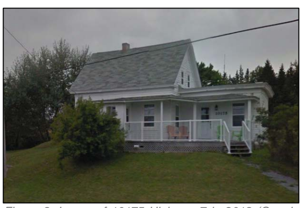
Figure 8: Image of 10175 Highway 7 in 2018