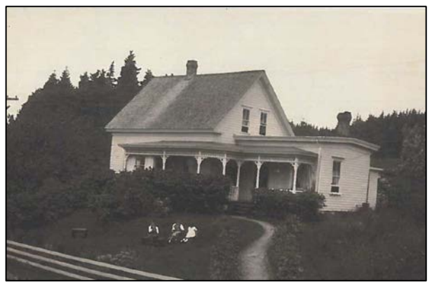
Figure 7: Photo of 10175 Highway 7 in 1930

The original wooden windows in the house have been replaced with modern materials but are still in their original locations. The chimneys have been simplified and the chimney of the summer kitchen completely removed.