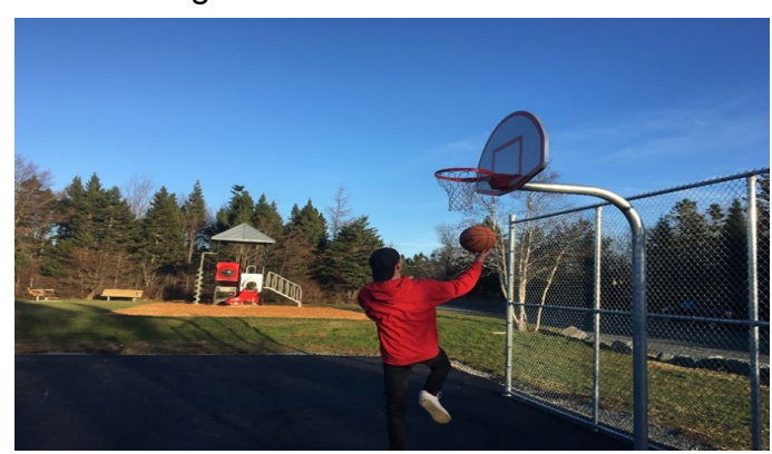
New playground and basketball court at Laura Drive Park!

You can also visit our <u>website</u> and enter your address to get a custom calendar.