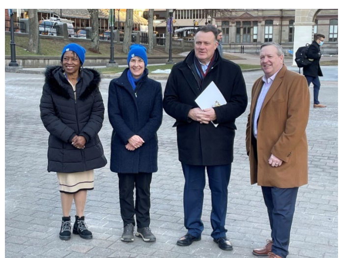
Bell Let's Talk Event