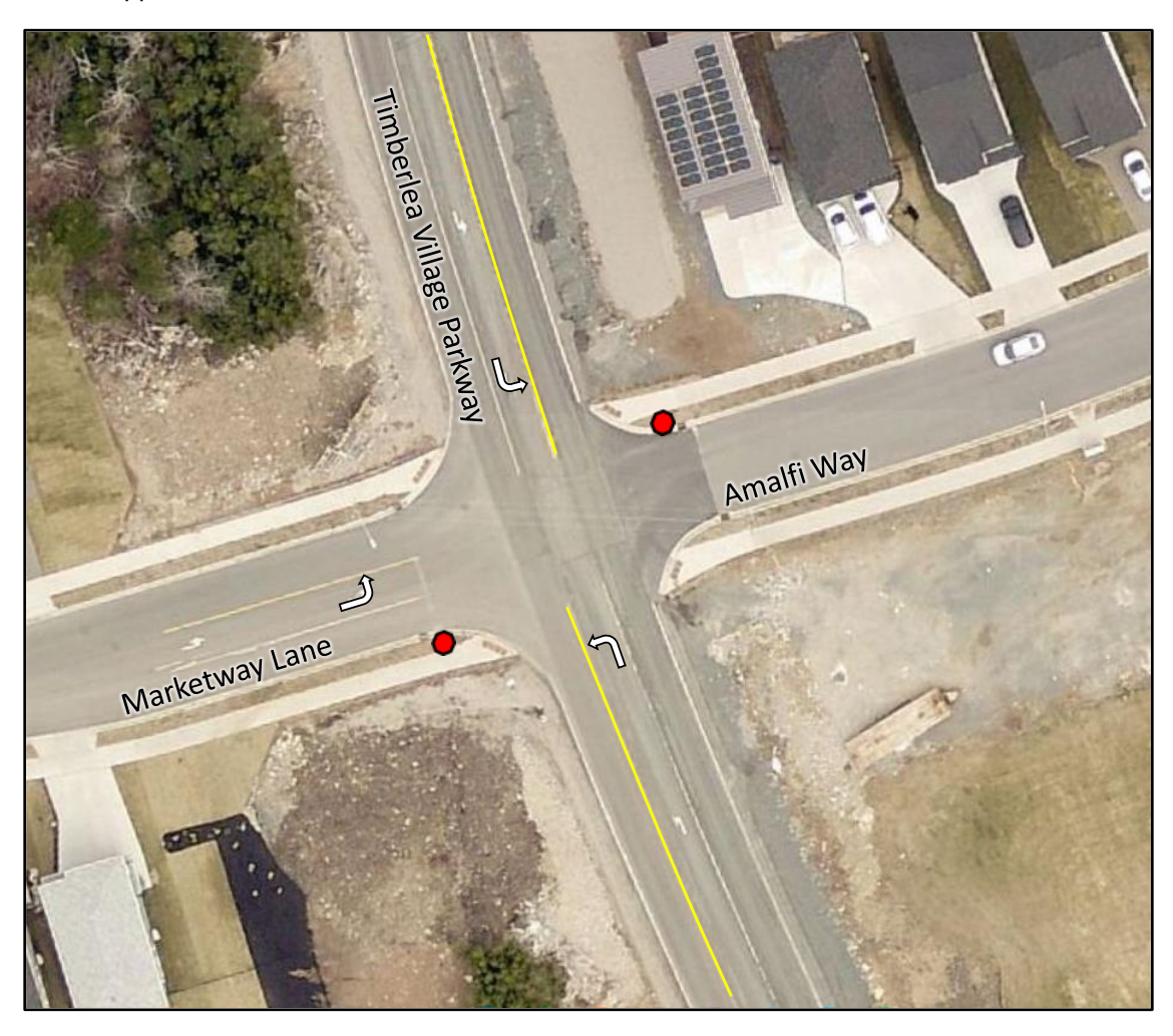
Figure 2: Intersection of Marketway Lane / Amalfi Way and Timberlea Village Parkway

The northern intersection is a four-legged, two-way stop-controlled intersection. Marketway Lane and Amalfi Way have 50 km/h posted speeds, and Timberlea Village Parkway, classified as an arterial street, has a 70 km/h posted speed. Timberlea Village Parkway has auxiliary left turn lanes in each direction. Amalfi Way is a single-lane, shared approach.