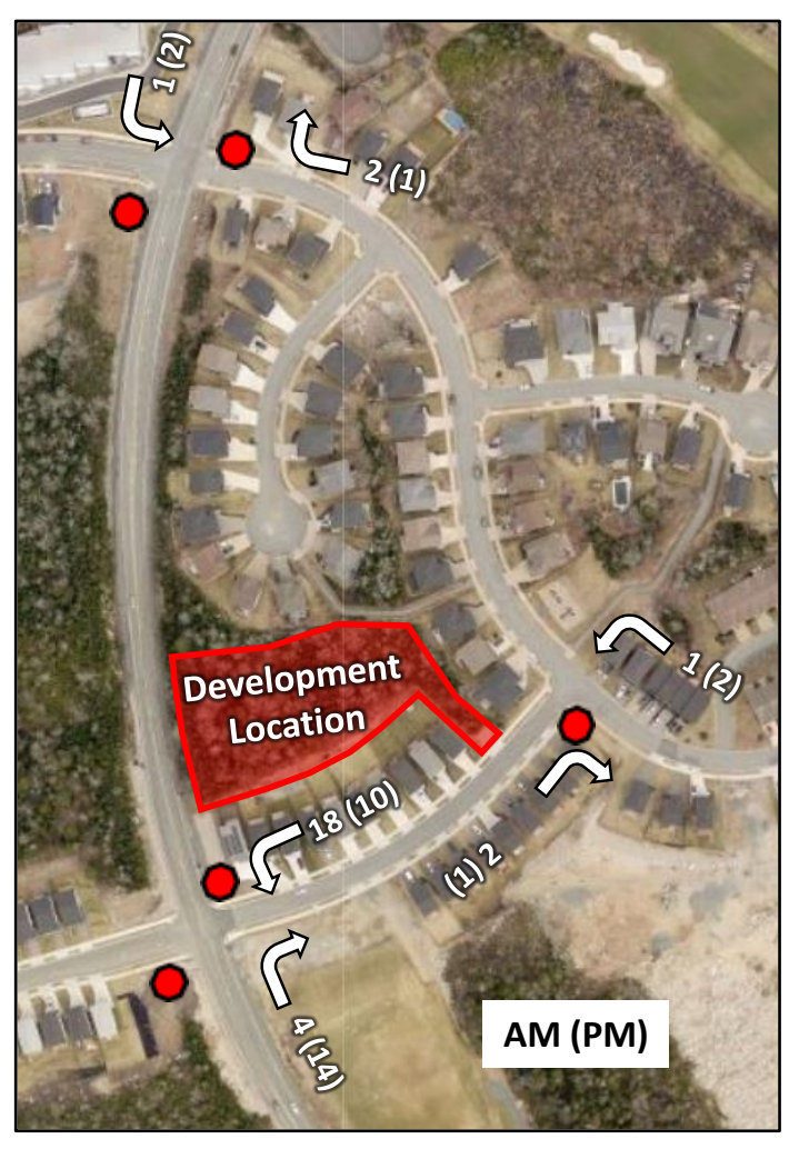
Figure 5: Site generated trip distribution