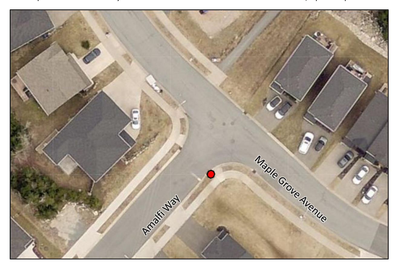
Figure 3: Intersection of Amalfi Way and Maple Grove Avenue

The Amalfi Way and Maple Grove Avenue intersection is a three-legged, two-way stop-controlled intersection, with stop control on Amalfi Way. Both streets are classified as local streets with 50 km/h posted speeds.