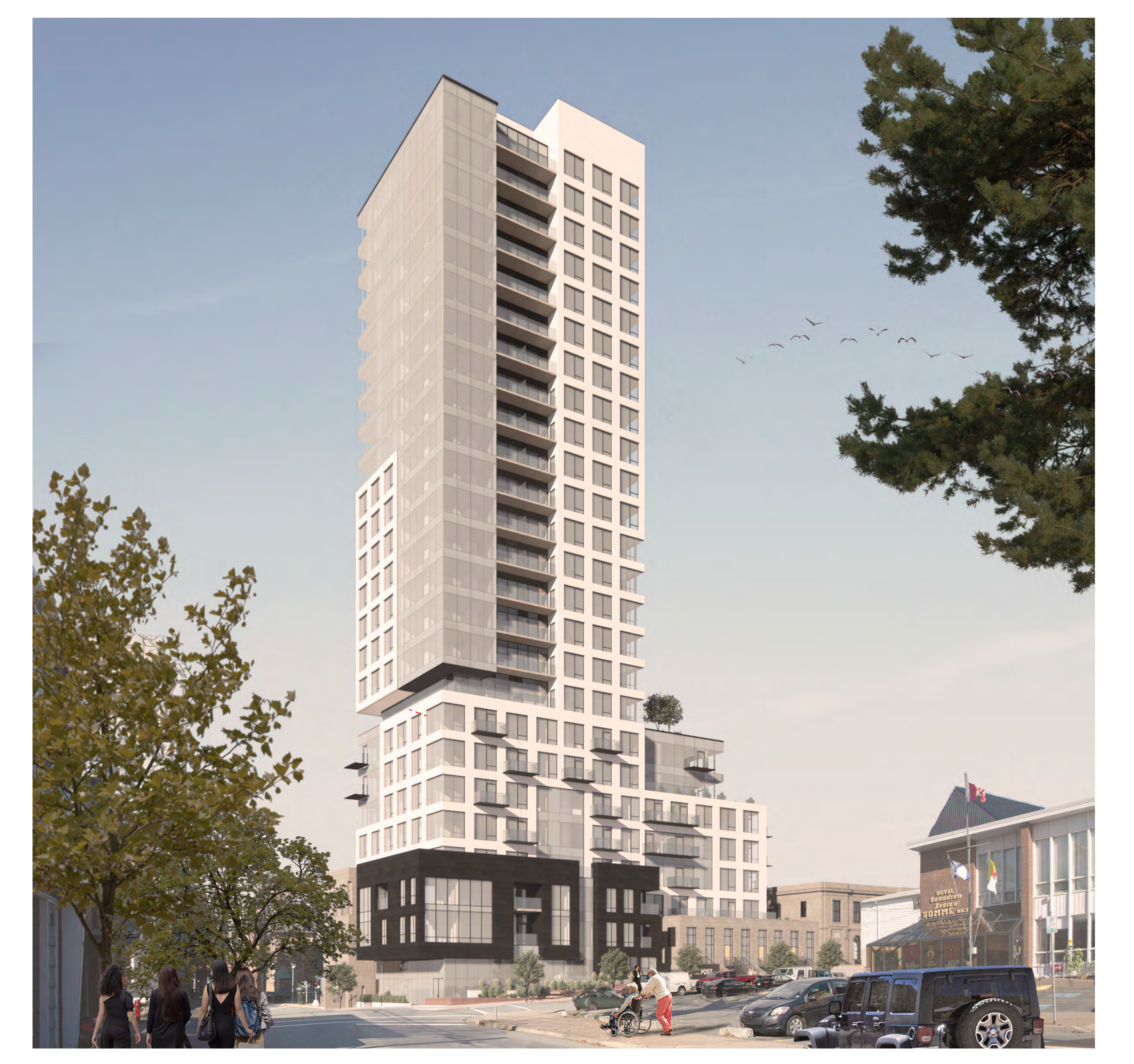
VIEW FROM PORTLAND AND KING