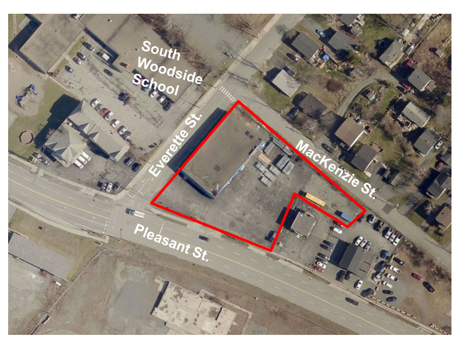
Site Boundaries in Red