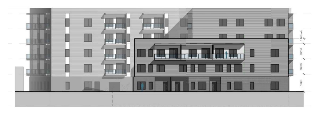
MACKENZIE ST ELEVATION