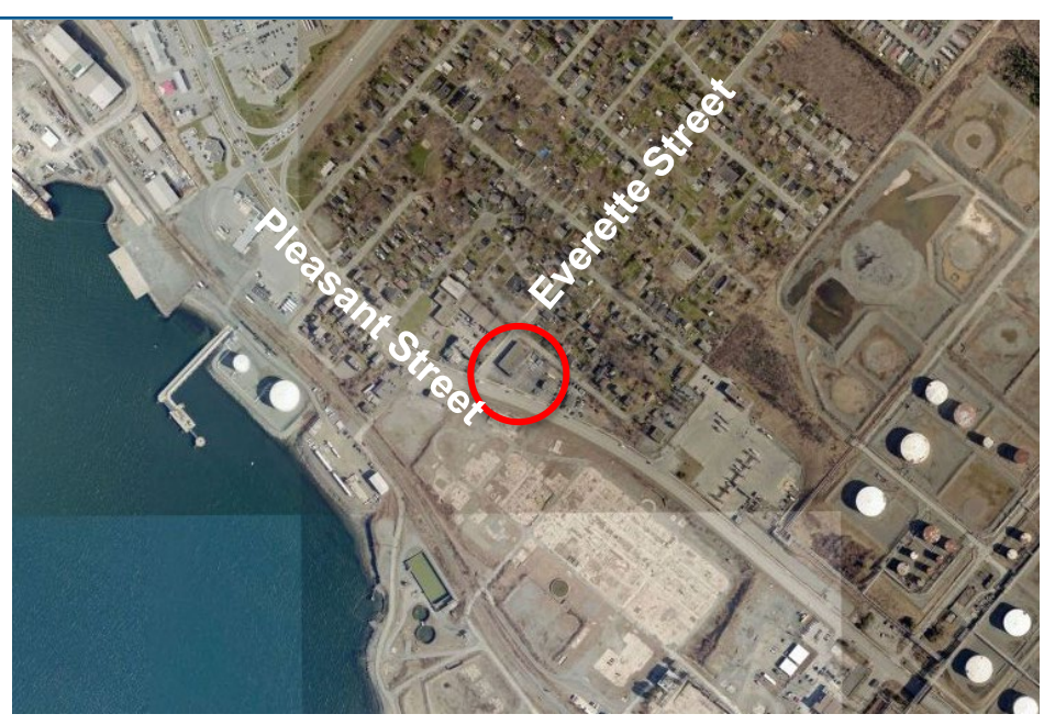
General Site location in Red