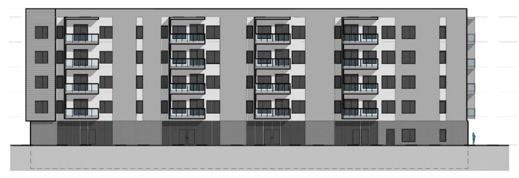
PLEASANT ST ELEVATION