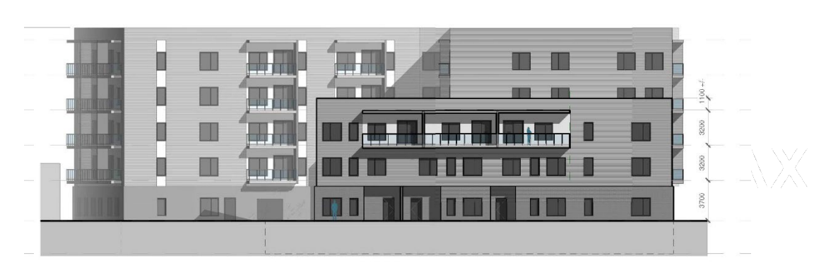
MACKENZIE ST ELEVATION