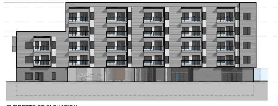
EVERETTE ST ELEVATION