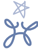
GRAND CHIEF MEMBERTOU 400

PORT ROYAL NATIONAL HISTORIC SITE JUNE 24, 2010