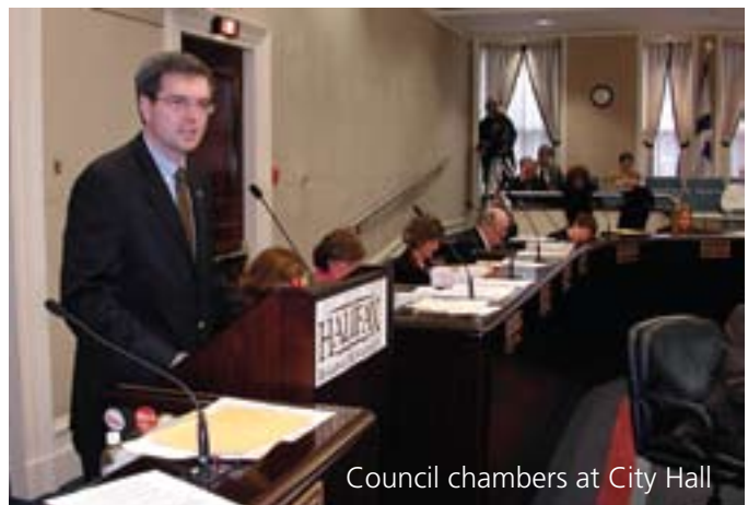
Council chambers at City Hall

Council agendas and schedules and municipal by-laws are posted online at www.halifax.ca .