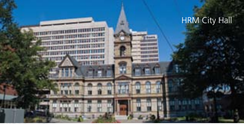
HRM City Hall

head of the federal government. In Canada, there are 303 members of parliament including the Prime Minister.