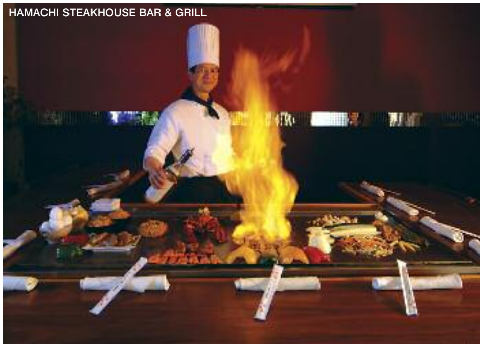
HAMACHI STEAKHOUSE BAR & GRILL