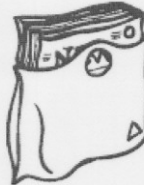
(Newspapers, office paper, flyers, envelopes, magazines, telephone books, etc)