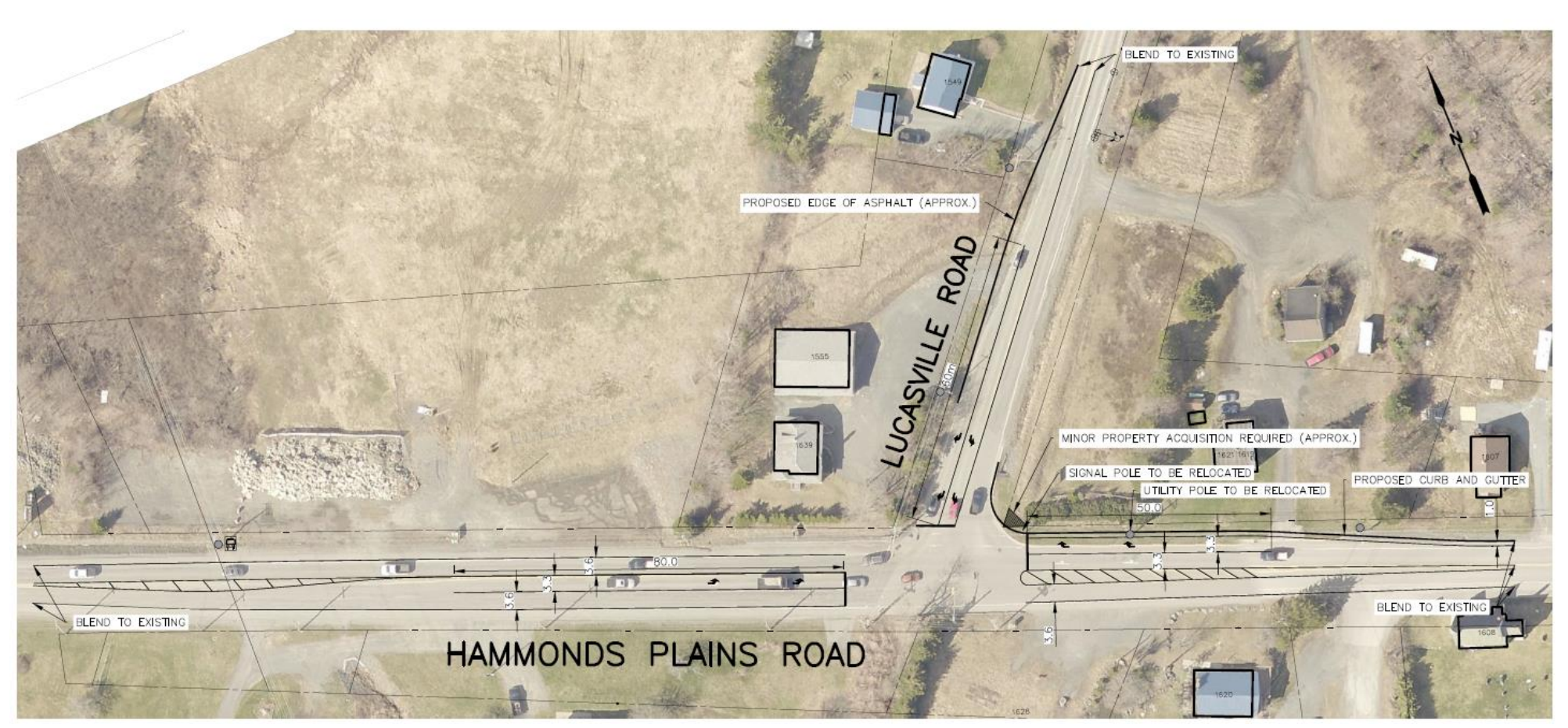
Figure 2: Potential Intersection Improvements