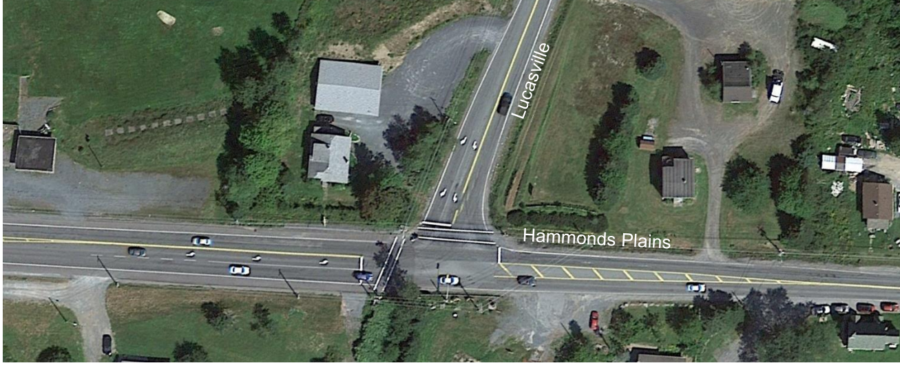
Figure 1: Hammonds Plains Road at Lucasville Road - Signalized Intersection

Traffic data was collected in early 2022 and traffic volumes were modelled to determine the existing conditions of the signal operation. Staff have identified changes to signal timing which can take effect without infrastructure changes to provide greater efficiency in traffic flow through the intersection during peak periods. Staff will continue to monitor for additional changes to traffic patterns and adjust signal phasing and timing accordingly as development continues.