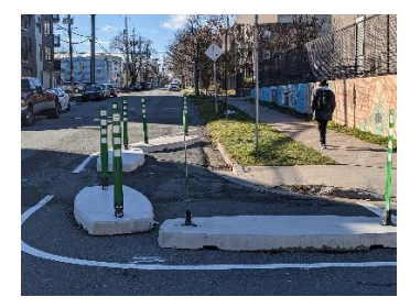
Examples of curb extensions that will be painted through this initiative.