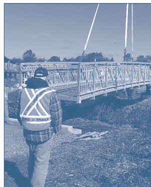
Installation of the Bissett Trail Bridge funded by District 4 Capital Funds

Submitted by the Cole Harbour Parks and Trails Association