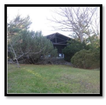
The Main House (1914)