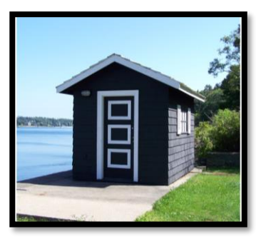
The Boat House (age unknown)