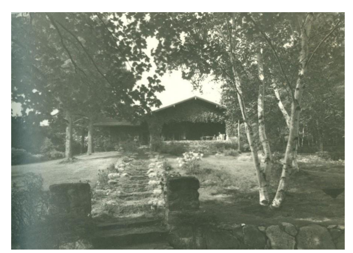
Main house (c.1914) as seen in 1955