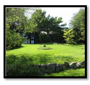
The Gardens and grounds