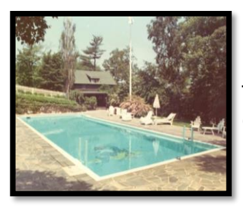
The Pool (c.1930s)