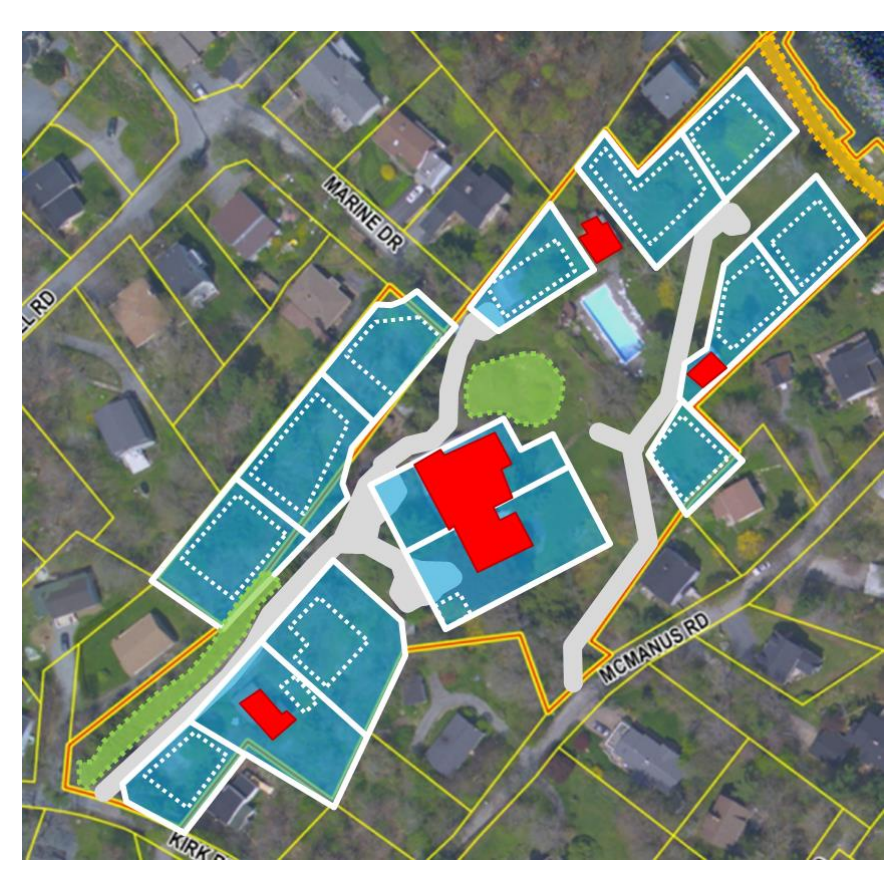
2010 Proposed condominium concept layout