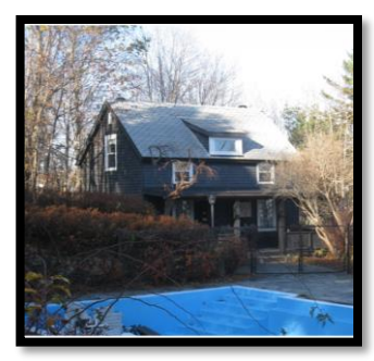
The Pool House (c.1865)