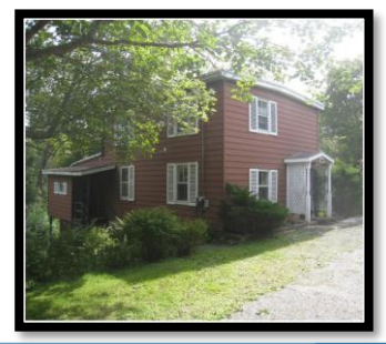
The Gate House (c.1910)