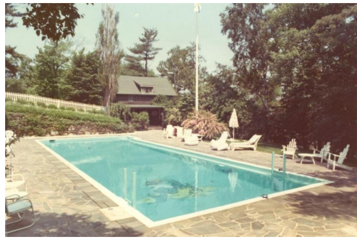
Pool and Pool House in 1972