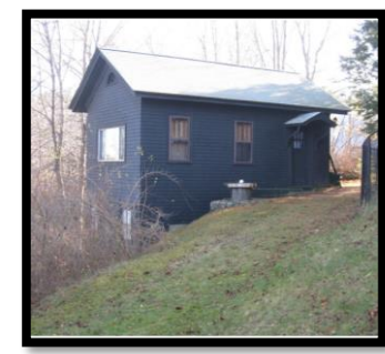
The Roost (c.1900)