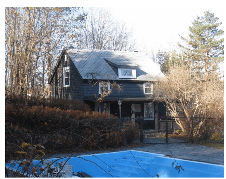
Pool Shanty, 2009.