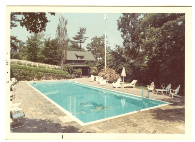
Pool Shanty, 1973.