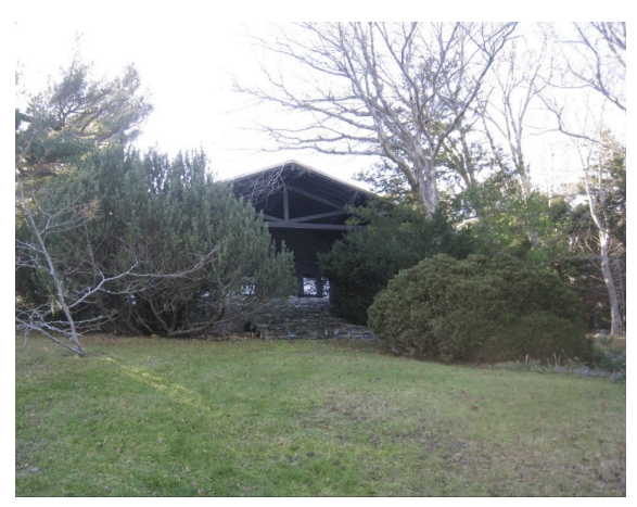
Main house, 2009.