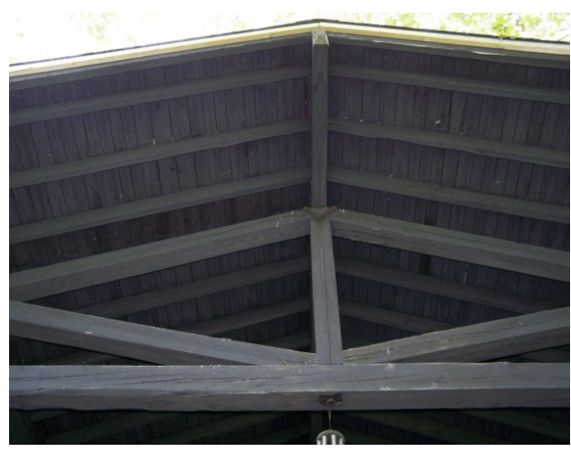
Main house - Art & Crafts exposed rafter detail