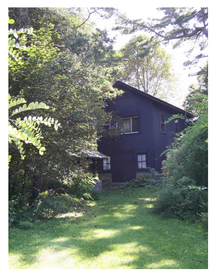
The Roost (rear), 2009.