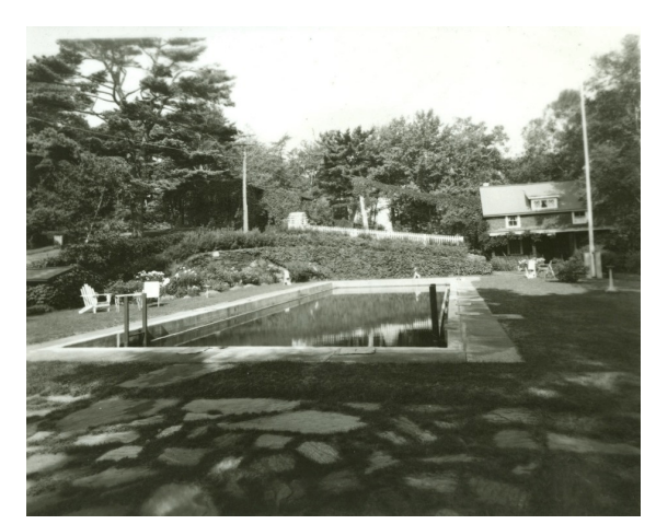
Pool Shanty, 1955.