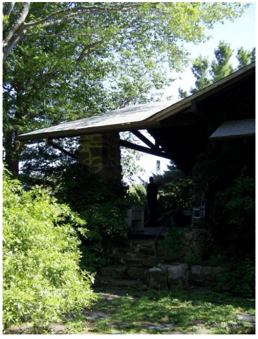
Main house (side), porch profile 2009.