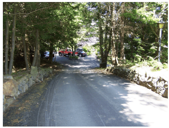
2' dry stone walls lining the driveway entrance (from Kirk Road).