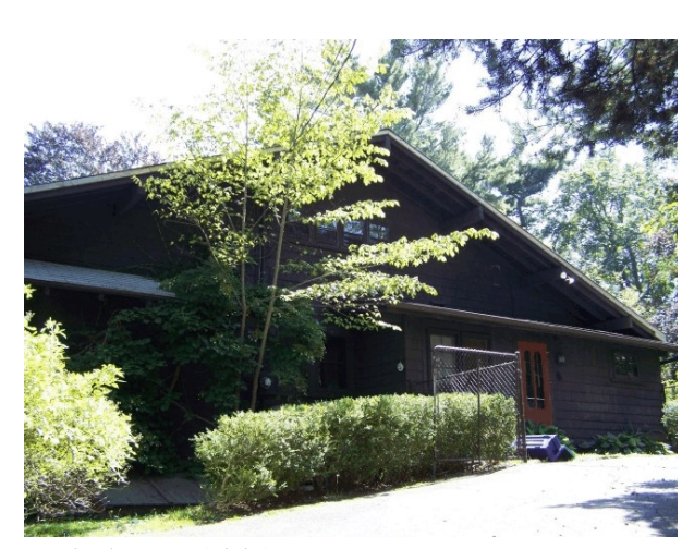
Main house (side), 2009,