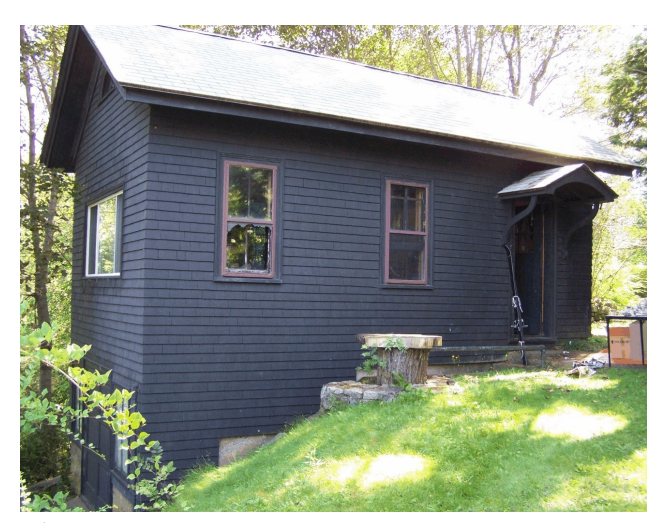
The Roost, 2009.