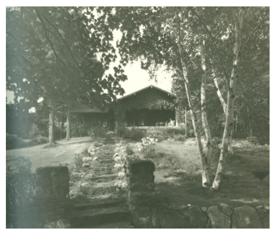
Main house, 1955.