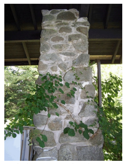
Main house - porch column.