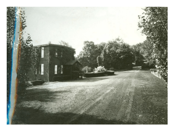
The Gate House, 1955.