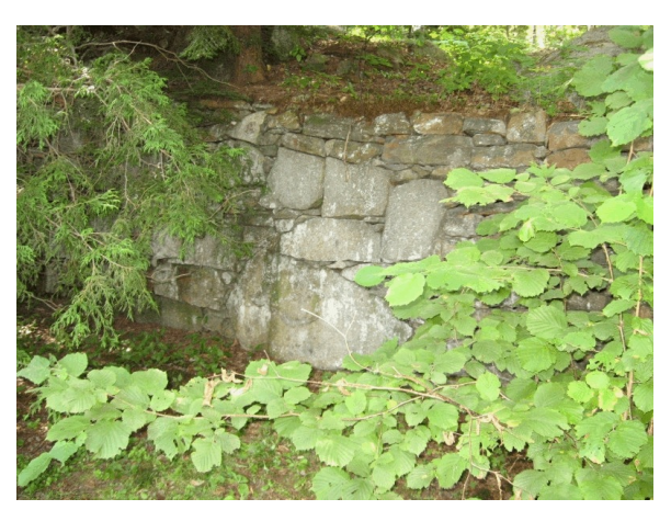
5' high dry stone wall (near main house).