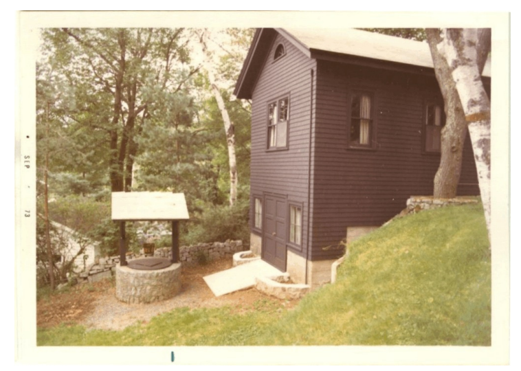
The Roost, 1973.