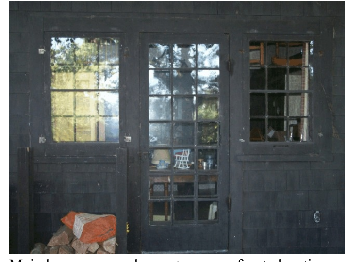
Main house - secondary entrance on front elevation.