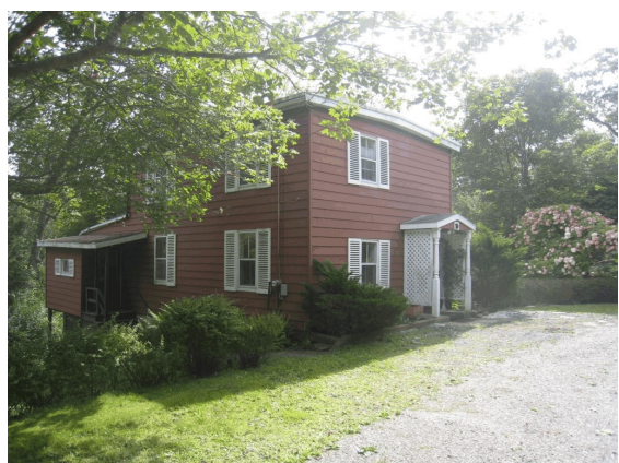
The Gate House, 2009.