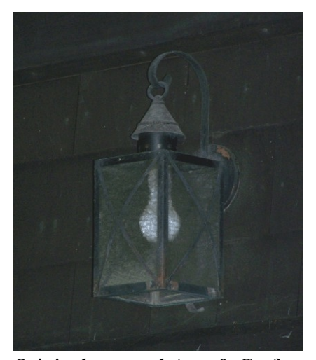
Original external Arts & Crafts light fixtures.