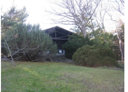
Main House (2010)