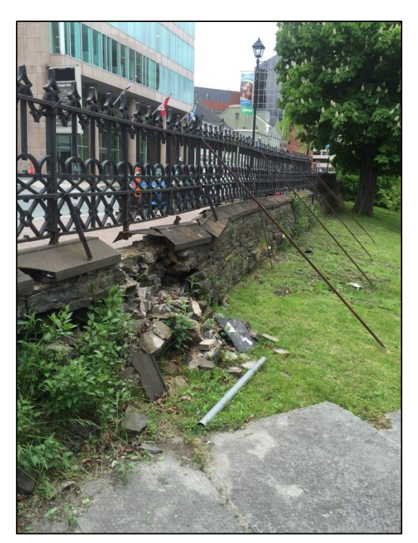
Figure 11: Failed wall section on Argyle Street.