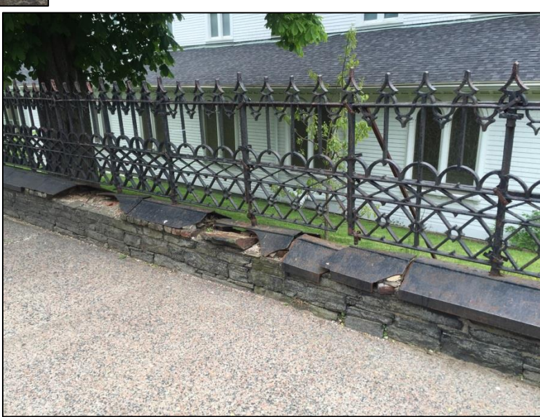
Figure 14: Wall section along Argyle Street.