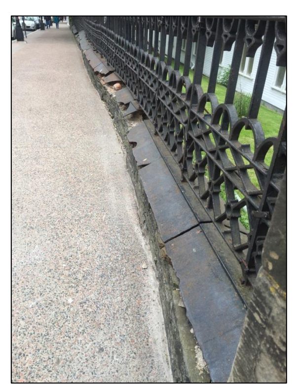
Figure 12: Bowed wall section & broken metal wall cap.