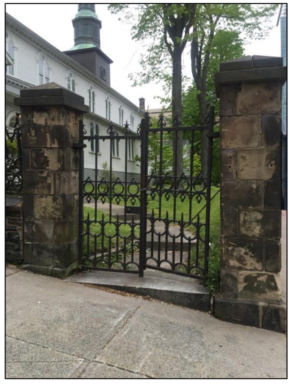
Figure 5: Gates at the corner of Barrington and Prince Streets.