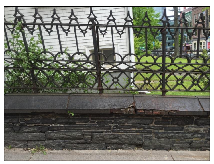
Figure 7: Wall section on Prince Street.