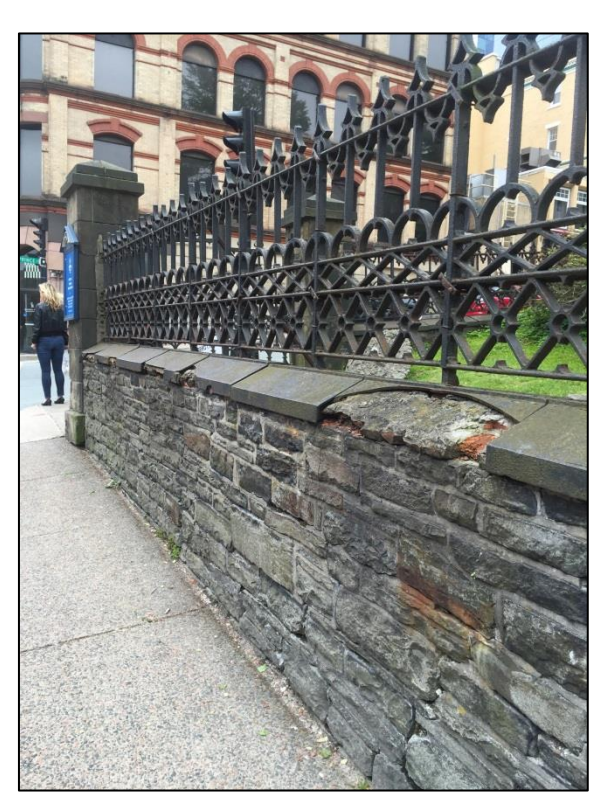
Figure 4: Wall section Barrington Street at Prince Street.