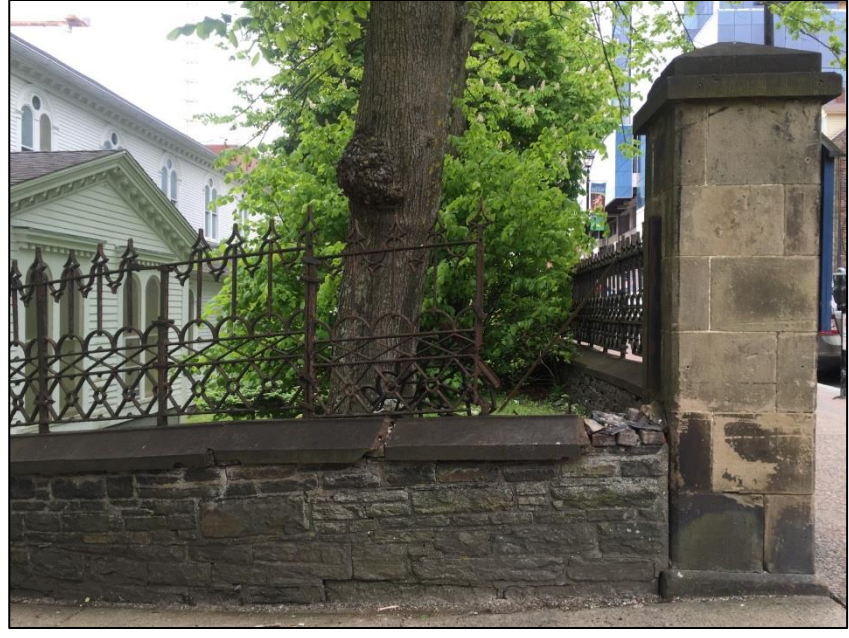
Figure 15: Wall section at Argyle Street abutting the Church.