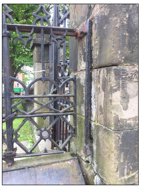
Figure 10: Ironwork failing at the Prince Street gates.