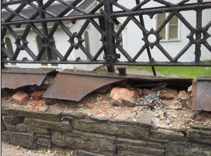
Figure 13: Failed metal cap and brick top course.