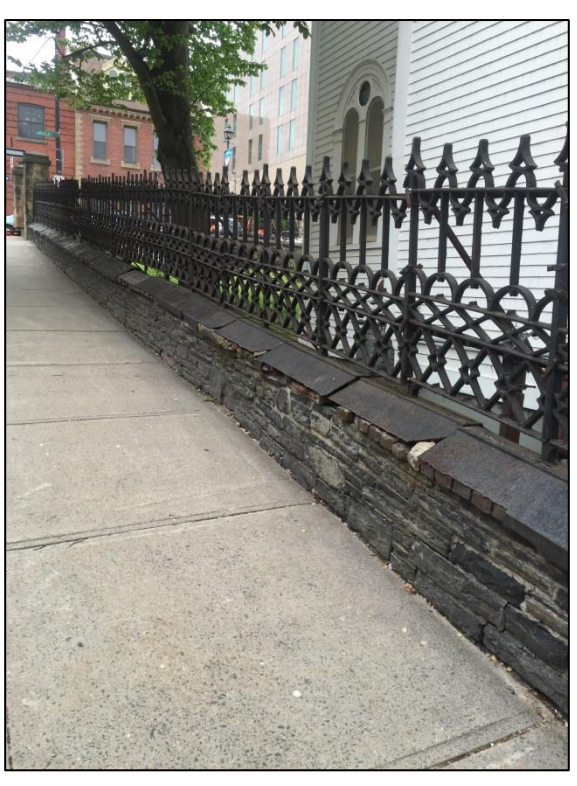
Figure 8: Wall sections on Prince Street.