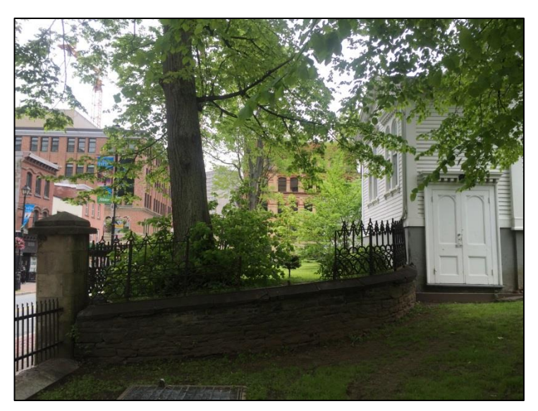
Figure 1: Wall section on Barrington Street abutting the Church.