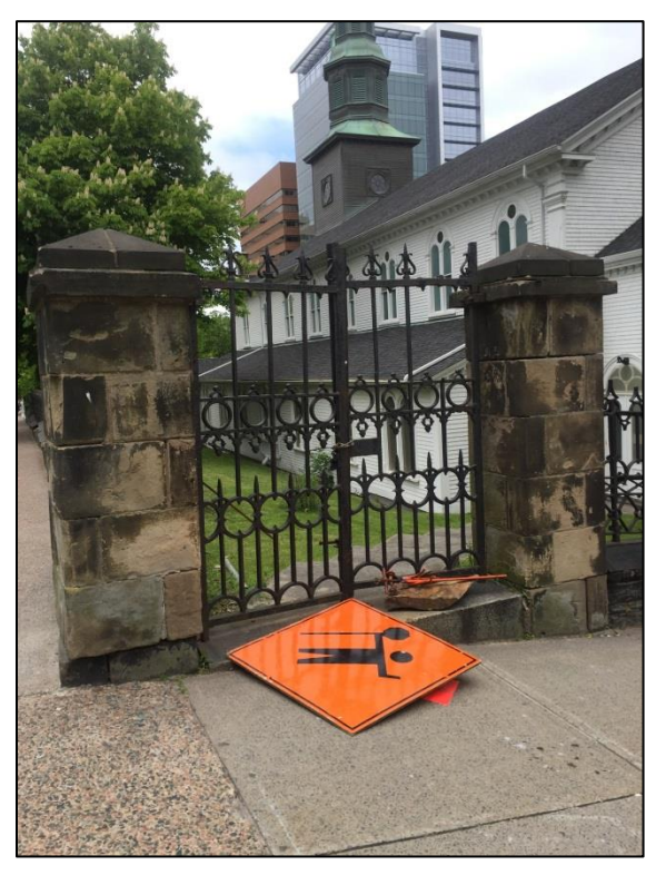
Figure 9: Gates at the corner of Prince and Argyle Streets.