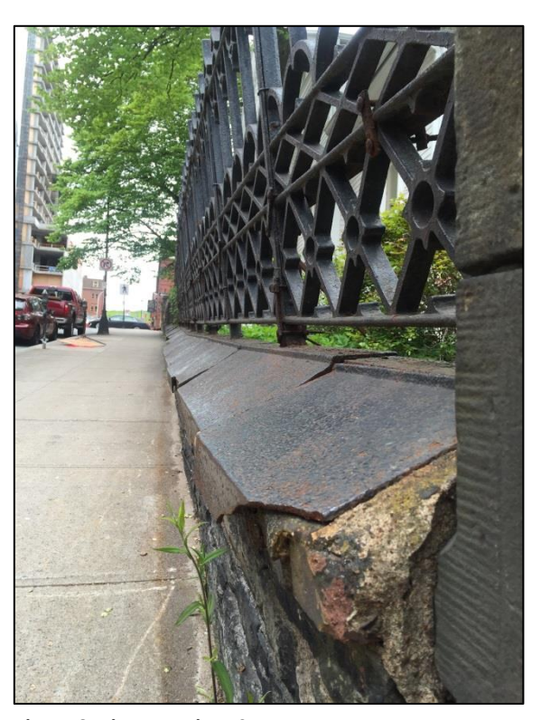
Figure 6: View up Prince Street.