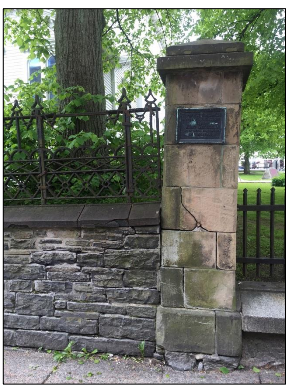
Figure 2: Sandstone pillar on Barrington Street.