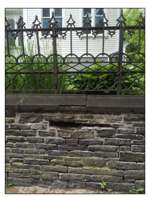
Figure 3: Wall section Barrington Street.