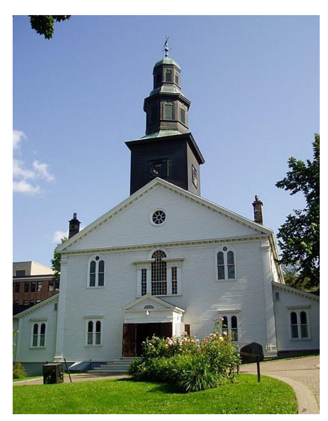
St. Paul's Church on Grand Parade