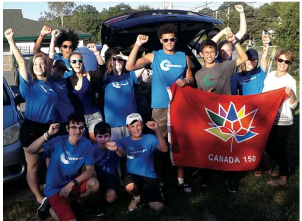
(Top) Youth from Tidal Impact got their hands dirty and their spirits lifted helping out at the Dartmouth North Community Garden.

All photos can be sent to hiltondr@rrss.ns.ca .