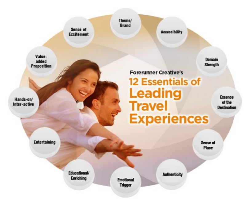
The 12 Essentials of Leading Travel Experiences

Every physical element involving the business plan has been predicated on the philosophy of engaging skilled accredited design professionals in such areas as graphic design, spatial design, signage, etc.