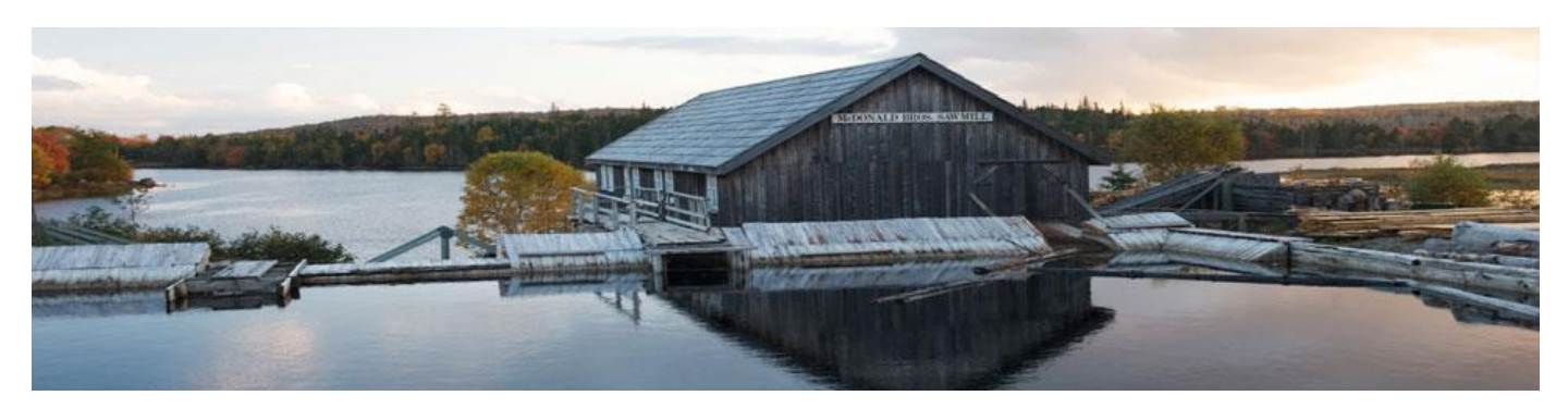
Outdoor Experiences/Outdoor Enthusiasts