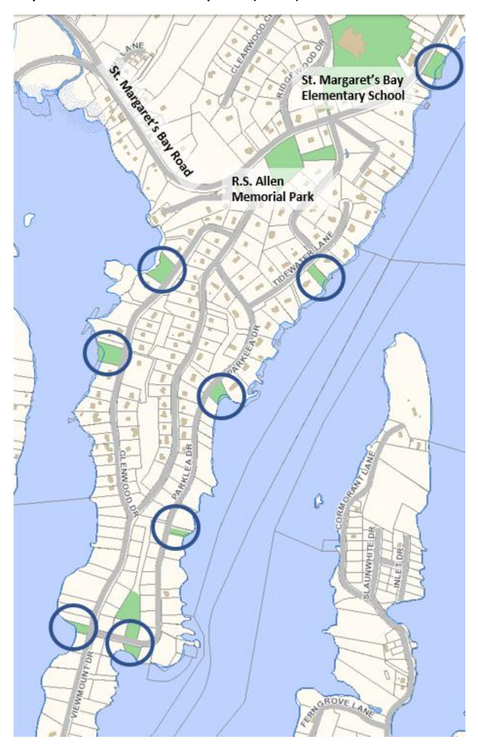
Map 2: HRM-owned waterfront parcels (circled)