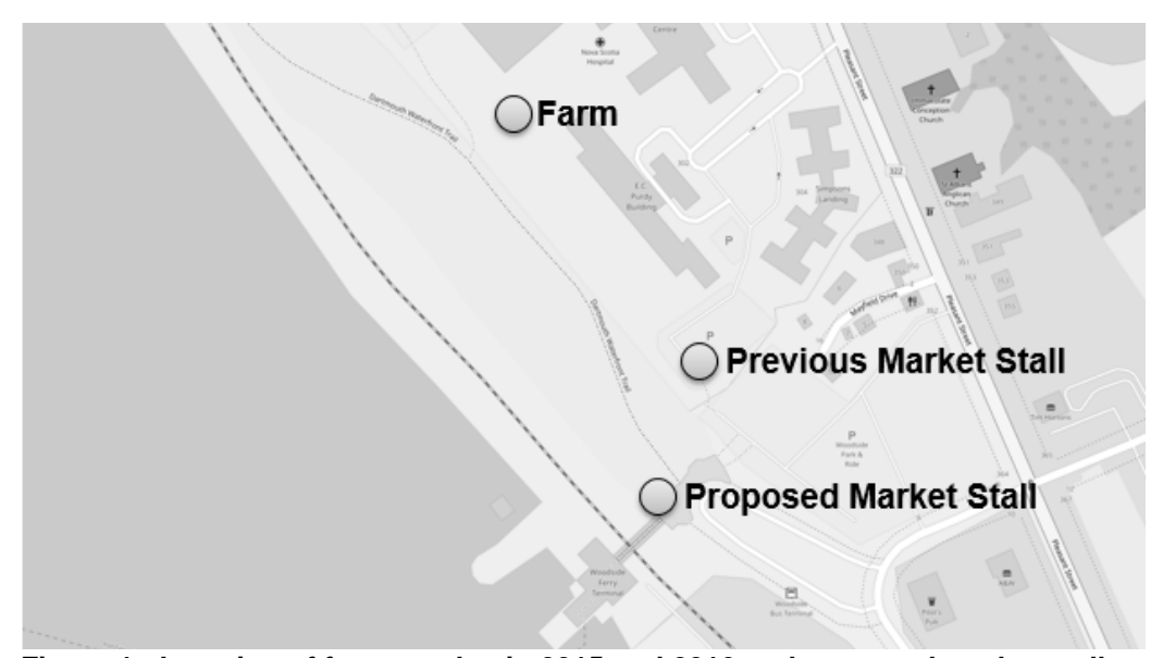
Figure 1 - Location of farm, market in 2015 and 2016 and proposed market stall

As noted above, the market garden is located on the grounds of the Nova Scotia Hospital on Pleasant Street, Dartmouth. This is approximately 300m from the Woodside Ferry Terminal (see Figure 1 below). A site visit with the organizer confirmed that the aim of the proposed market is to "catch people on the way out of the terminal." Although hospital staff and clients may still walk to the market, the reason for relocating the market is to capture higher pedestrian volume outside the terminal building.