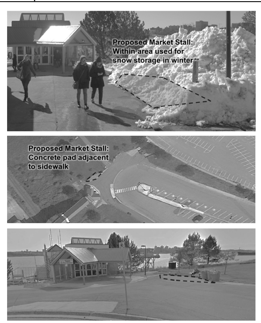
Figure 2 - Proposed Location of Market Stall (Site visit photograph, Google Earth, Google Street View)