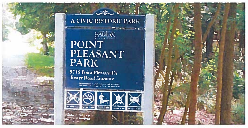
Existing HRM Park address sign

The building's program will be determined through a future planning process and may consider the following uses: