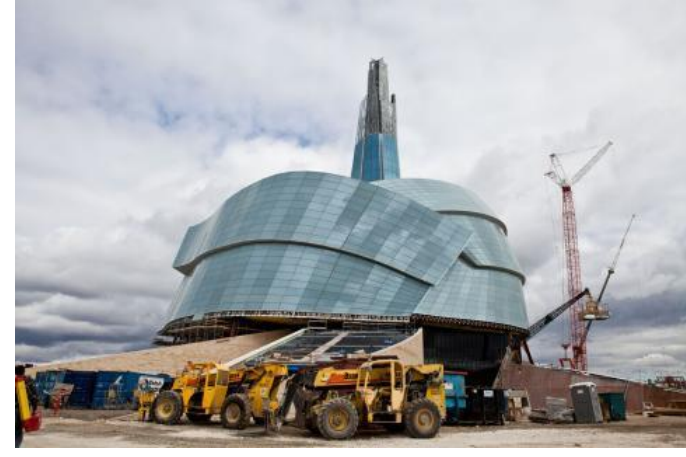
Canadian Museum for Human Rights, Winnipeg

This article is written by a Winnipeg-based blogger in the context of the Canadian Museum for Human Rights which has been quoted by its CEO as rivalling the Sydney Opera House, the Eiffel Tower and the Guggenheim. The capital budget is reportedly over $350 million. Early attendance estimates for this facility are in the 250,000 range.