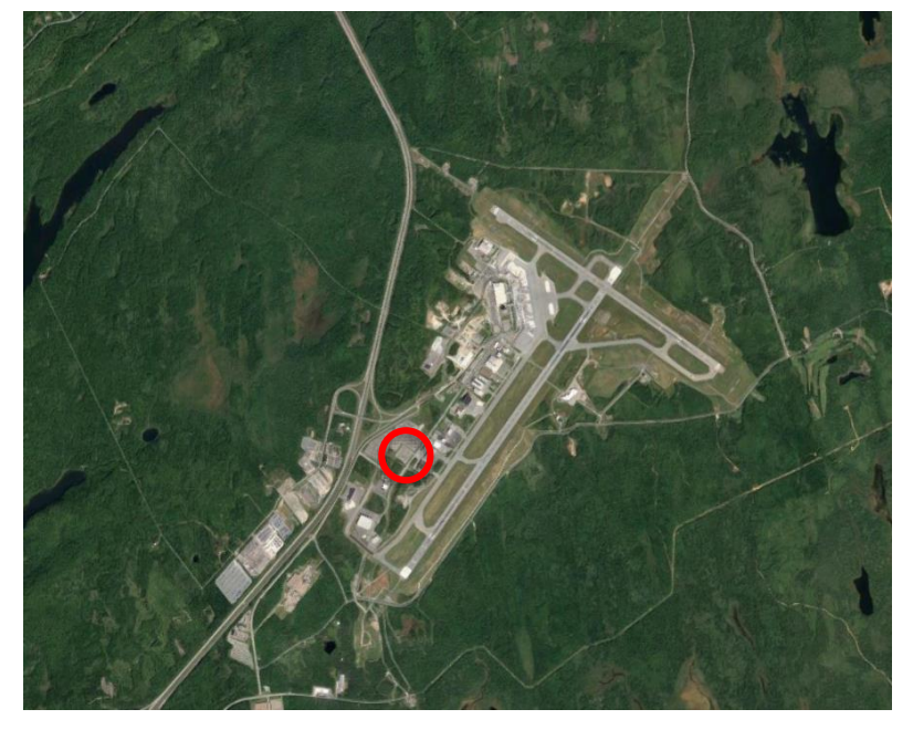
General Site location