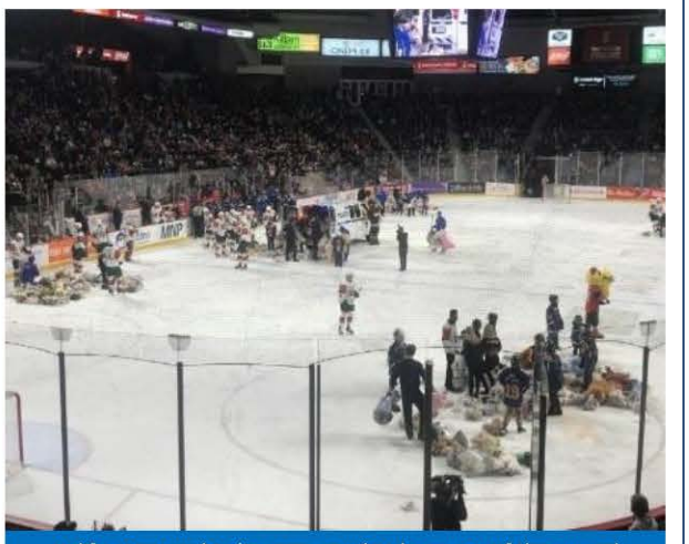
Halifax Regional Police are proud to be a part of the annual Teddy Bear Toss.

Halifax Regional Police (HRP) proudly participated in the annual Halifax Mooseheads Teddy Bear Toss. On January 27, HRP members collected stuffed animals during a hockey game at the Scotiabank Centre.