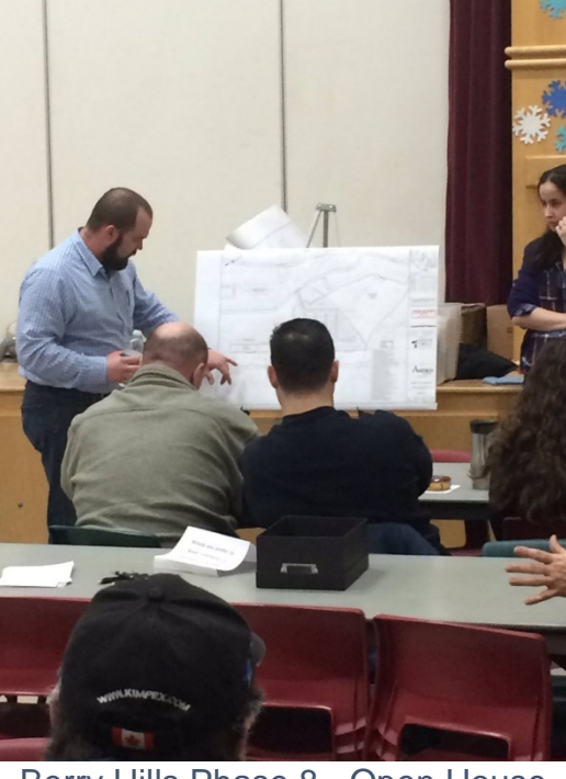
Berry Hills Phase 8 - Open House

I was pleased to attend all three community events. Each meeting reminded me of what a vibrant and active district we have!