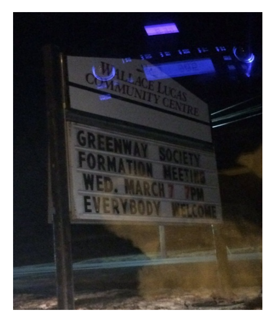
Greenway Society Formation Meeting at Wallace Lucas Community Centre, Lucasville