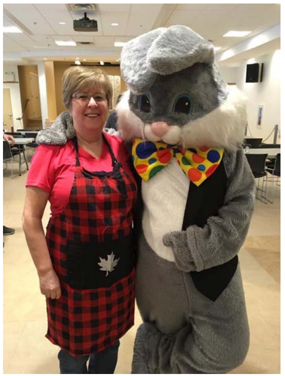
That's me in the bowtie!