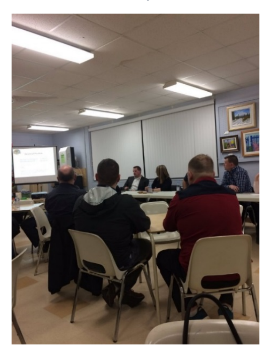
Waterstone Residents Neighbourhood AGM