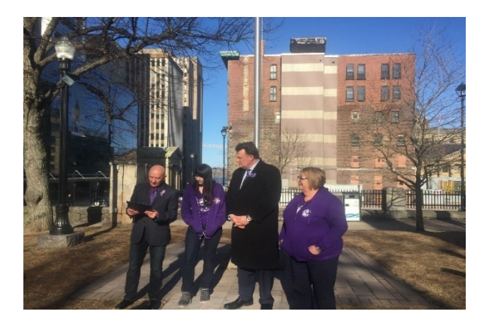
I was honoured to read the proclamation declaring March 26th Purple Day for Epilepsy