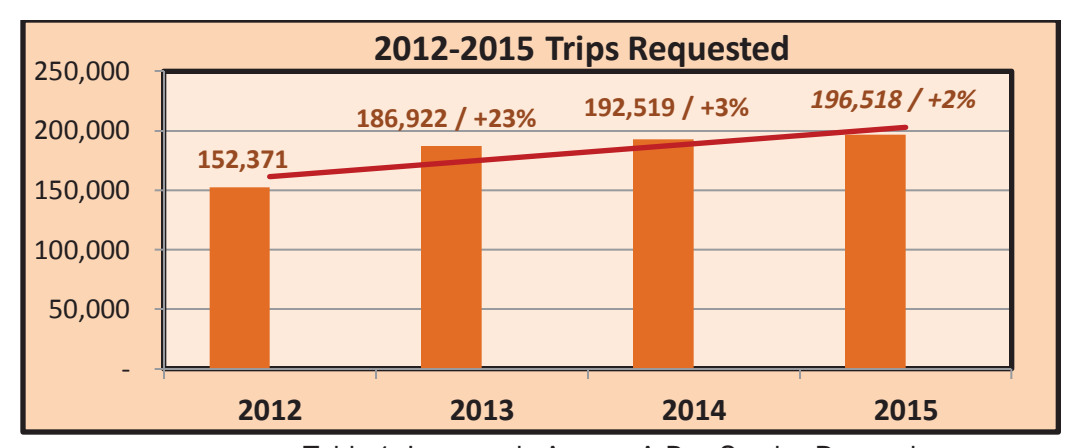
Table 1: Increase in Access-A-Bus Service Demand

As illustrated in Table 1 below, there has been a steady increase in service demand since 2012. While additional staff and vehicles have been added to the fleet, demand has outstripped supply; clients who cannot be booked for a trip on a service day are placed on a wait list. The wait list annual totals are illustrated in Table 2. While there was a slight reduction in the annual wait list figures for 2015, this statistic is considered an aberration and the upward trend is projected to continue for follow-on years as demand continues to increase at a pace greater than service supply.