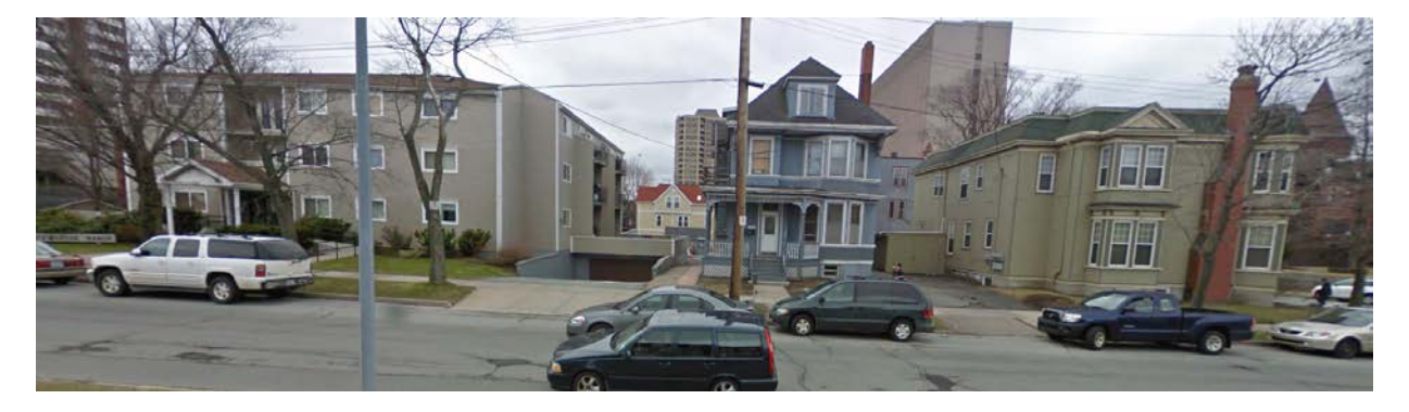
Figure 2: Existing structures looking east from Robie Street (Civic 1389 Robie, 1377 Robie and 5993 College)

Figure 2 shows three (3) of the six (6) onsite structures to be demolished and removed. Civic 1389 Robie St. is a 3-storey multi-unit residential building covering 8,600ft<sup>2</sup> containing 24 dwelling units. Civic 1377 Robie St. is a 3-storey residential building covering 1,500ft<sup>2</sup> containing 4 dwelling units. Civic 5993 College St. is a 2-storey residential building covering 2,070ft<sup>2</sup> with 4 dwelling units.