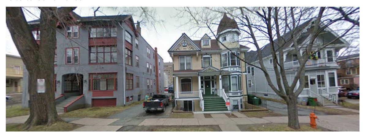
Figure 1: Existing structures looking north from College Street (Civic 5963 College, 5969 College & 5977 College).

The existing buildings occupying the proposed site at the corner of Robie Street and College Street. will be demolished and removed, and have a combined square footage of approximately 21,300ft<sup>2</sup> of residential space. Figure 1 and Figure 2 show the existing buildings on site to be removed.