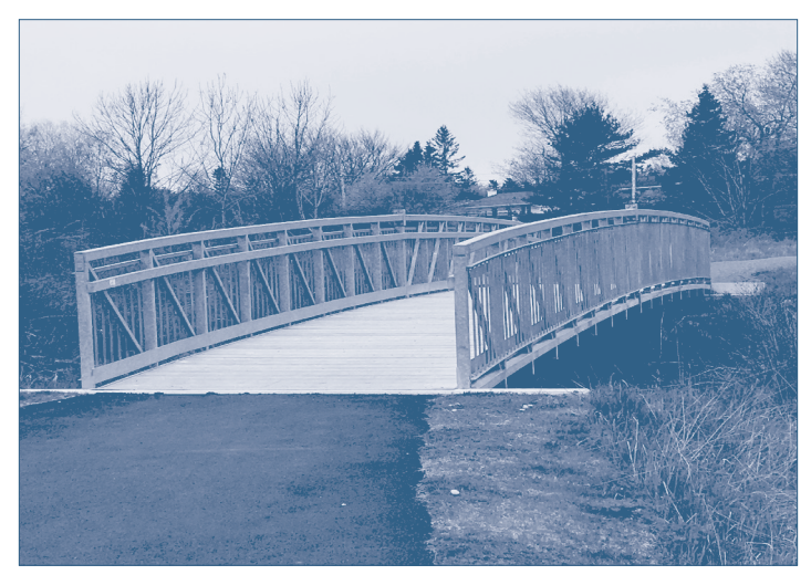
Bissett Lake Trail Phase 1 Bridge

HRM is working with the Cole Harbour Parks and Trails Association to extend the Bissett Greenway to provide a safe and convenient connection for residents to Cole Harbour Heritage Park and points beyond. The greenway extension will start near Brookview Dr. and go up and over the former Rehab property and connect to the Cole Harbour Heritage Trail system at the parking lot on Bissett Road. The total length is 500 metres and the total cost will be about $400,000. While some of the grades are steep, a key part of the design is to keep the grades as accessible as possible. HRM is currently conducting detailed design and getting ready to build this extension in 2018.