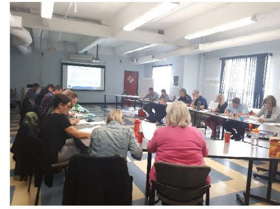
Photograph: Participants of the PR Course at the HRP Training Centre

As part of our focus on communication capacity building, the HRP PR Unit instructed two days of PR training to sworn officers from various ranks and units as well as civilian subject matter experts. Topics encompassed strategic communications, traditional media relations and social media.