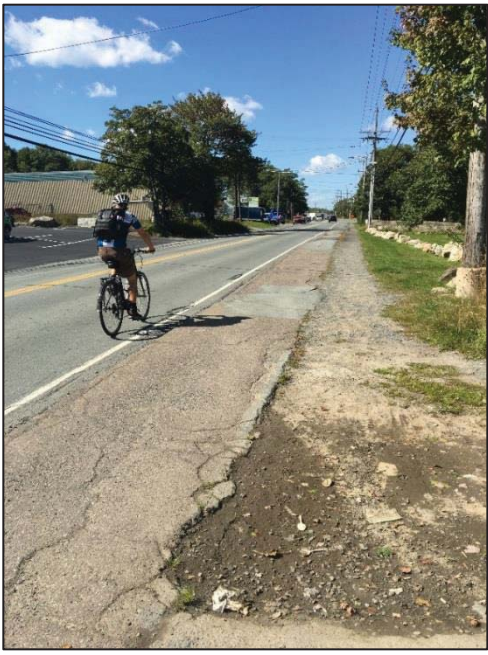
Figure 4: Crumbling Shoulder Sept 2017