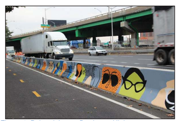
Figure 1: Painted Jersey Barrier on Highway

The majority of these solutions would be successful in creating the perceived separation between pedestrians and vehicles (with the exception of paint). Pedestrians may feel more comfortable using this space. Further, the effect is a visually narrowed roadway that has the potential to slow traffic and alert drivers to the pedestrian area (see Figure 1, Figure 2).