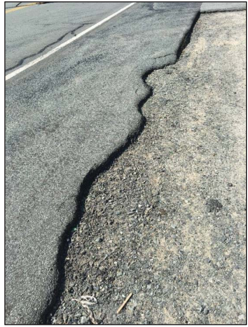
Figure 3: Inconsistent Shoulder Width Sept 2017

Regardless of which design treatment or barrier style is chosen, professional standards recommend a 0.6m (2ft) offset buffer from the white line on the edge of the travel lane for safety purposes. This would be taken from the existing 2m (6.5ft) paved shoulder that is already sub-standard and crumbling in most sections (Figure 3, Figure 4). If the barrier itself takes approximately 0.3m (1ft), the result of what's left would be a crumbling shoulder that is 1.1m (3.5ft) or less in width.