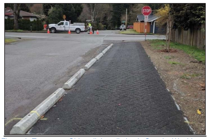
Figure 6: Temporary Sidewalk Installation in Seattle, Washington