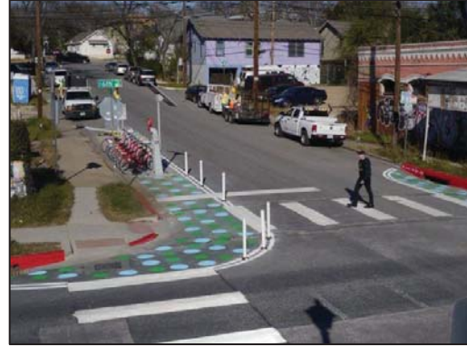
Figure 2: Pedestrian Improvements by Painting Roadway and Adding Bollards

The following factors were considered in developing an interim solution: