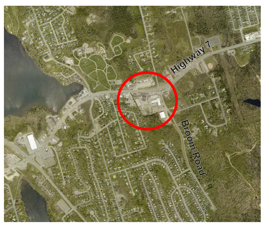
General Site location