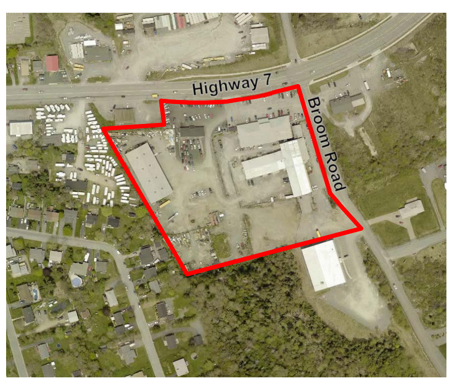
Site Boundaries in Red