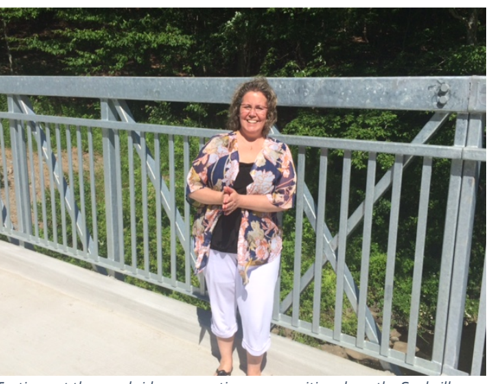
Testing out the new bridge connecting communities along the Sackville Greenway