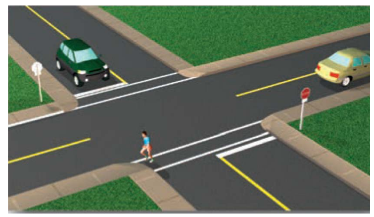
Pedestrian at an intersection with a marked crosswalk.

<u>The Nova Scotia Driver's Handbook</u> states in Chapter 2 Rules of the Road that: Every intersection has a crosswalk. Many are unmarked. Drivers must yield to pedestrians at all intersections, whether crosswalks are marked or unmarked.