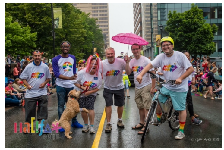
Wet 'n Wild Pride Parade this year with thousands lining the streets to celebrate our diversity.