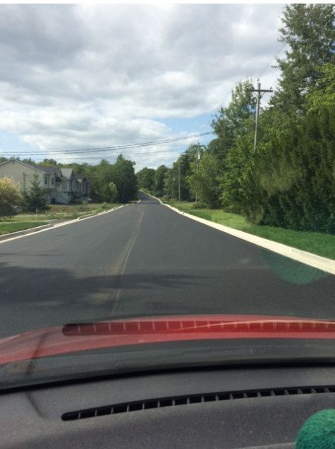
Checking out the recent paving project in the Green Forest Subdivision